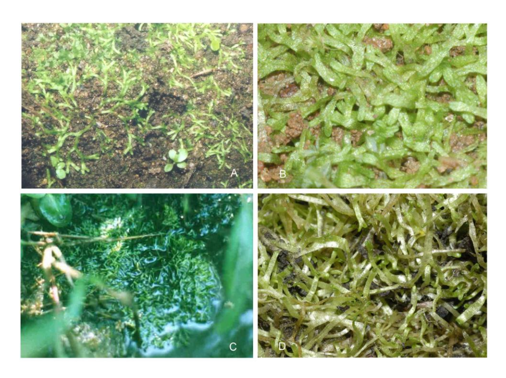
Figure 1. Riccia stricta specimens collected from different localities of Western Ghats, A: KPR 106927 (terricolous). B: MCN 84369 (terricolous). C: MCN 84511 (aquatic). D: KPR 99809 (aquatic).

Riccia fluitans auct. mult. non L., Species Plantarum 1139. 1753; emend K.Mueller, Aufl. 6 Bd. 1. Abt. 204. f. 134. 1907. Ricciella fluitans (L.) A.Braun, Species Plantarum 1139. 1753. Riccia canaliculata Hoffm., Deutsch. Fl. 2: 96. 1795. R. canaliculata Hoffm. var. fluitans Schiffn., Oester. Bot. Zeitsch. 49: 387. 1899. Riccia duplex Lorb. & K.Mueller, Hedwigia 80: 100. 1941. Riccia media Klingm., Flora 146: 616. 1958.