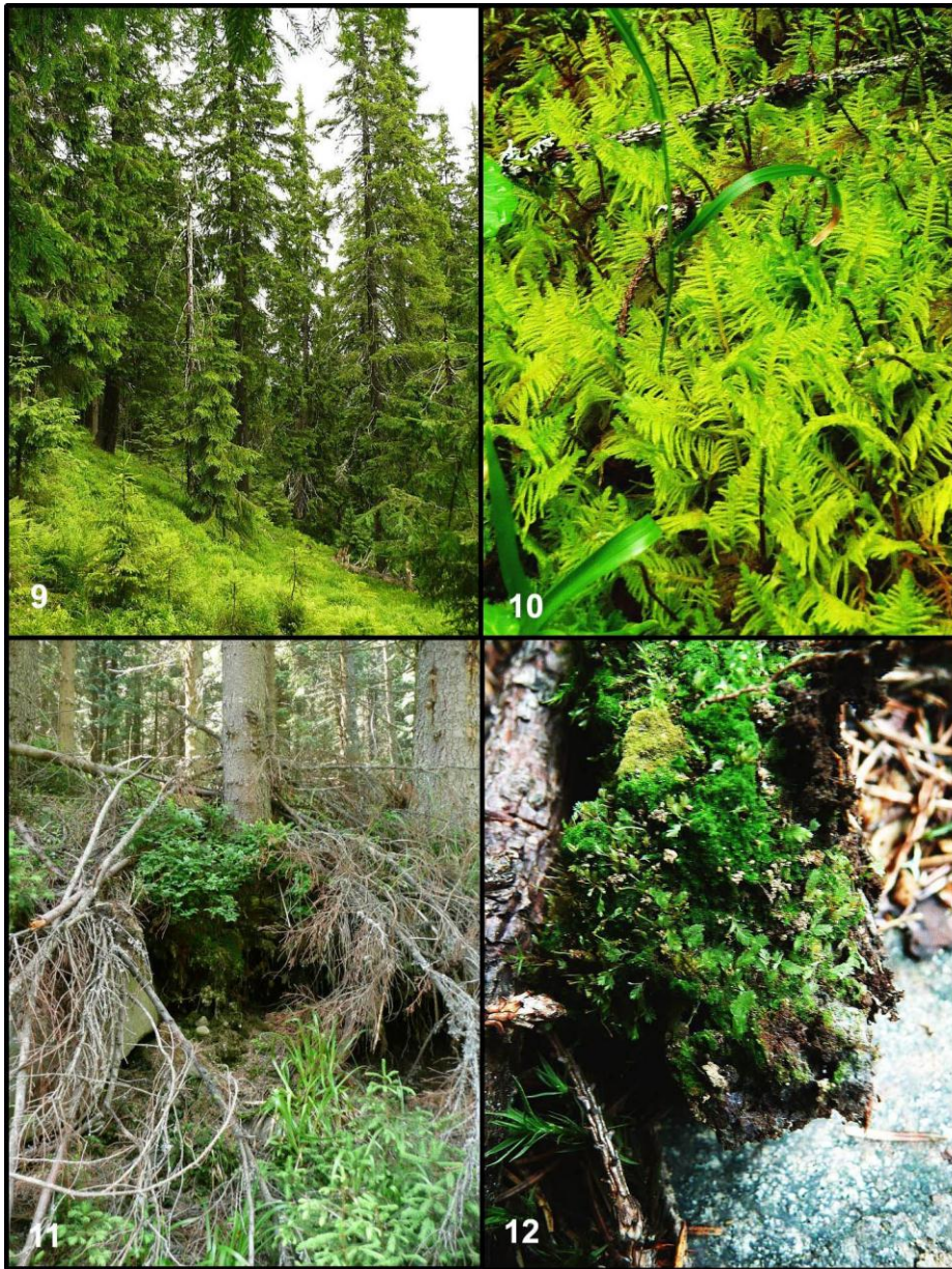
Plate II. Fig. 9: Primaeval acidophilous spruce forest on the N slopes of the Neagra Șarului valley head, at 1610 m alt. (Loc. 16). Fig. 10: Ptilium crista-castrensis on the litter of acidophilous spruce forest of Puturosul valley, at 1100 m alt. (Loc. 5). Fig. 11: Typical habitat of Schistostega pennata , in the cavity under the root system of a spruce (Loc. 5). Schistostega pennata in the cavity.