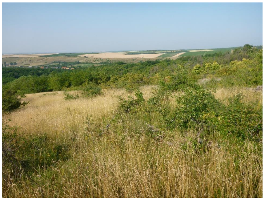
Figure 3. Habitat of Campanula macrostachya at village of Szomolya village (7 July 2015).

locality, but also take part in the natural regeneration phase in secondary succession (Baráth 1963).