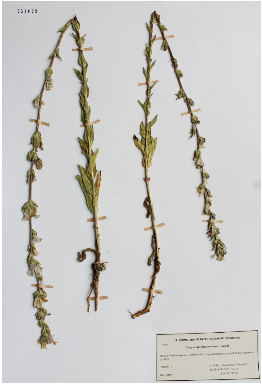
Figure 2. Voucher specimen of Campanula macrostachya (ID number: BP7510721).