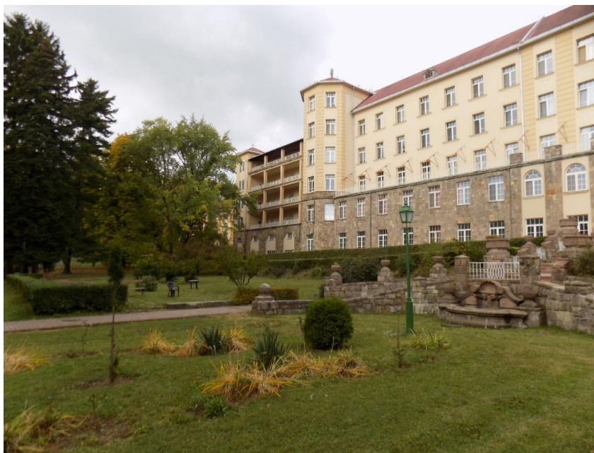
Figure 3. The mown lawn habitat of park of Hospitals Mátra