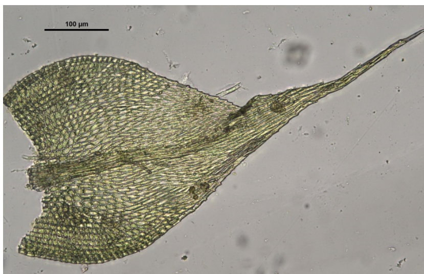
Figure 2. Stem leaf of Scorpiurium sendtneri [Albanian specimen BP 185817 published in Marka et al. (2013) and Papp et al. (2018)].

at base. The branches are up to 0,5 cm long, not curved in dry conditions, which is a characteristic feature of S. circinatum (Pedrotti 2006). There is one more specimen from Montenegro collected by Szepesfalvy at Herceg Novi (Szepesfalvy 1931). However, it was not found in Herbarium BP. Therefore the occurrence of this species in Montenegro is doubtful.