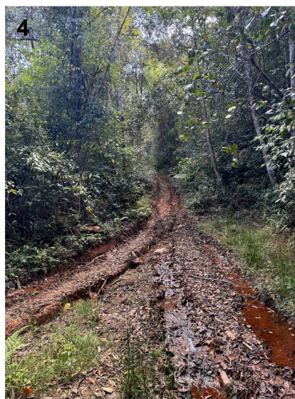
Figures 2–4. Collecting habitats: 2 and 4. Montane evergreen forest at locality 2405; 3. Disturbed evergreen forest at locality 2404.